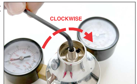
Fig: Image 6