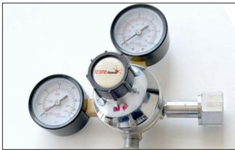
Fig: Image 1