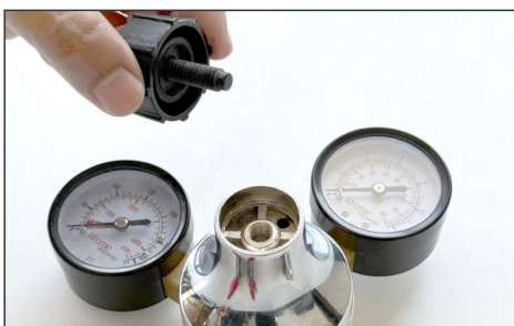
Fig: Image 3