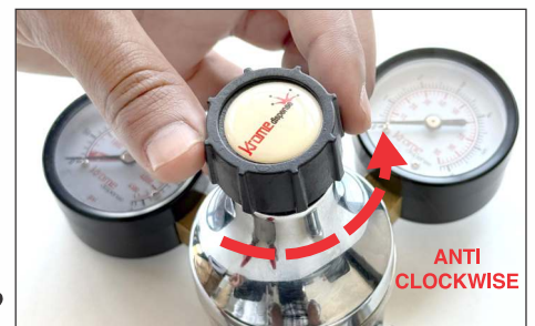
Fig: Image 2